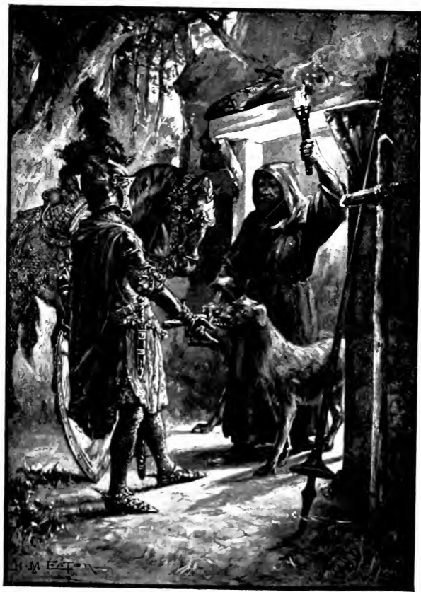
THE FIGURE OF A TALL KNIGHT STOOD BEFORE HIM.